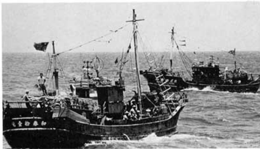
The bulk of boarding on Area Six was Chinats . . .