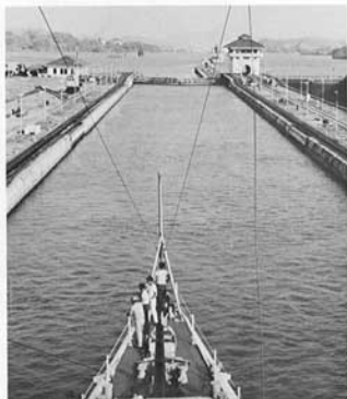
The Canal Had Its Ups ...