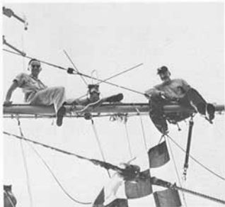
A Bird's Eye View

Completing the trip through the Panama Canal, an eight hour stop was at Rodman Naval Station, Pacific side, where the ship and crew refueled. Then off to WEST-PAC.