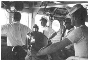
. . . and directs us out of the harbor.