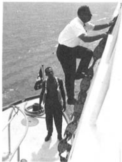
Our pilot boards the NORTHWIND . . .