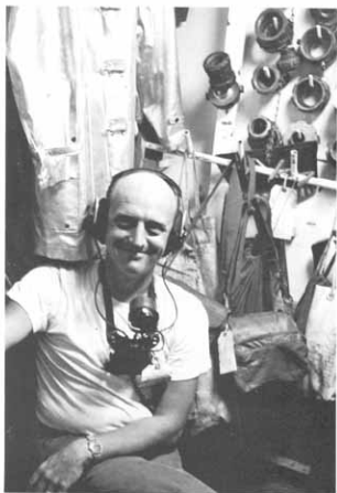
"These earphones always mess up my hair."