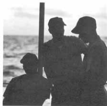
The 2000 club.