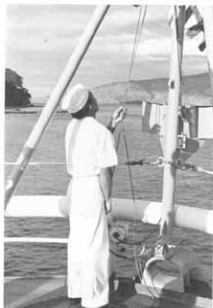
"Who stole my laundry?"