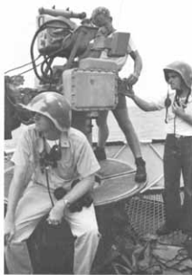
"I wonder how many trees we got this time?"