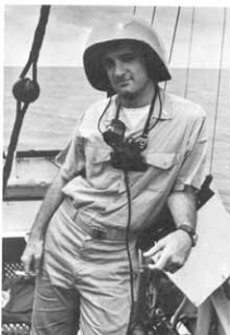
"And what have you done for the war effort?"